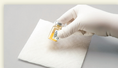
Figure 2: Tap firmly to mix.