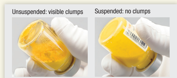
Figure 3: Check for unsuspended powder and repeat tapping if needed.