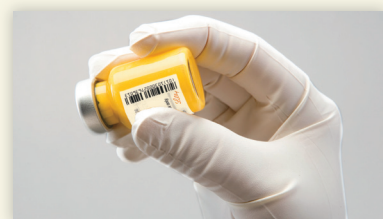
Figure 4: Vigorously shake vial.