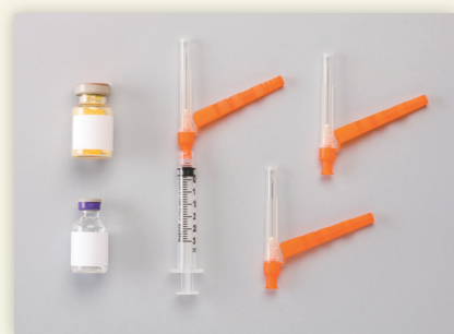
Figure 1: Contents of convenience kit.